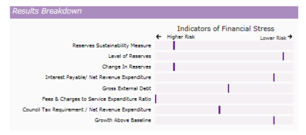
Table: Showing CIPFA Indicators of Financial Stress for Hastings BC

189. Flowing from the financial problems at Northampton CC, CIPFA developed a range of financial indicators relating to the resilience of local authorities given the funding crisis. The latest results are shown below – based on 2018-19 figures.