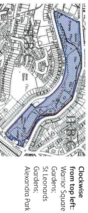
Clockwise from top left: Warrior Square Gardens; St Leonards Gardens; Alexandra Park